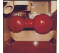
Machine with 3 µm CJC™ Off-line Filter: No oil change and no tank cleaning required