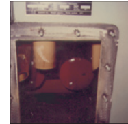
Machine with 6 µm pressure filter: Oil change and tank cleaning required